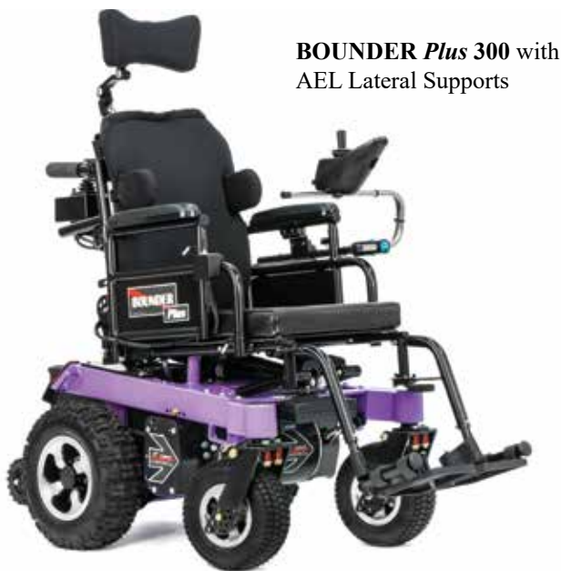
BOUNDER Plus 300 with AEL Lateral Supports

Custom built to order dimensions, with options available for foam types and thicknesses. Black Naugahyde upholstery is standard.