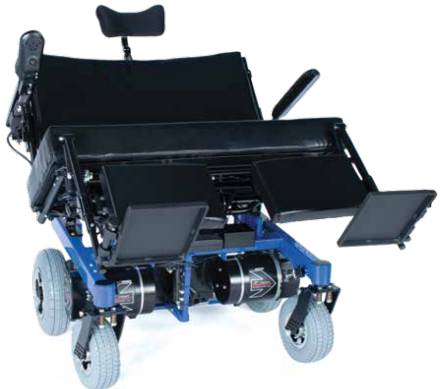
BIG BOUNDER 1000 with optional Power Tilt