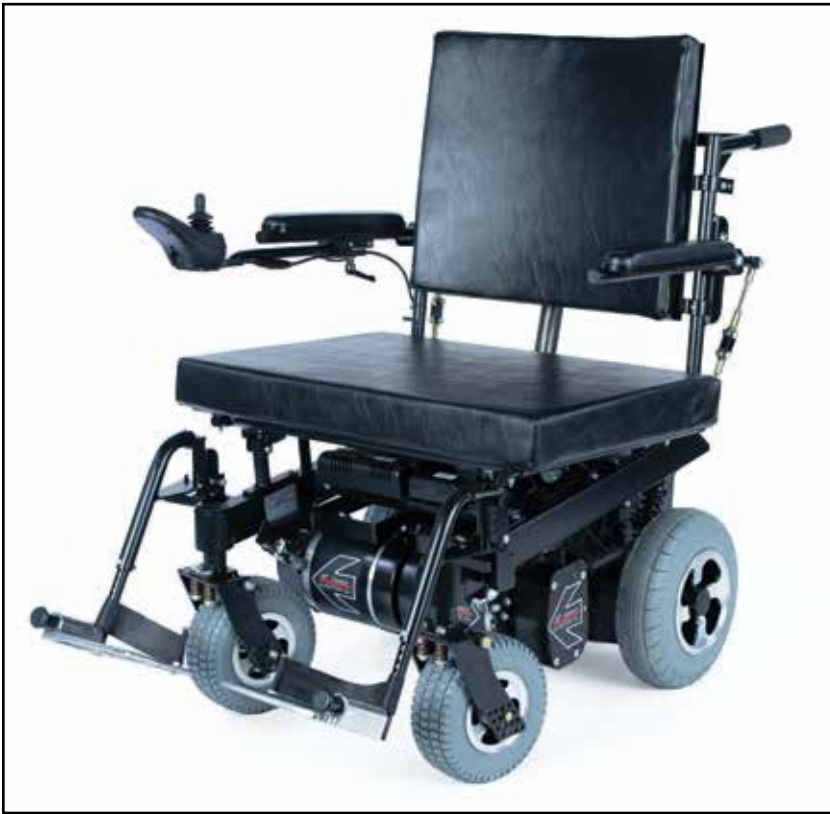
BIG BOUNDER 600