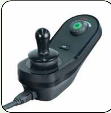
LiNX REM110 - basic hand control

LiNX REM400 - advanced touch screen hand control with Bluetooth including mouse mover. Paddle switches optional ➤