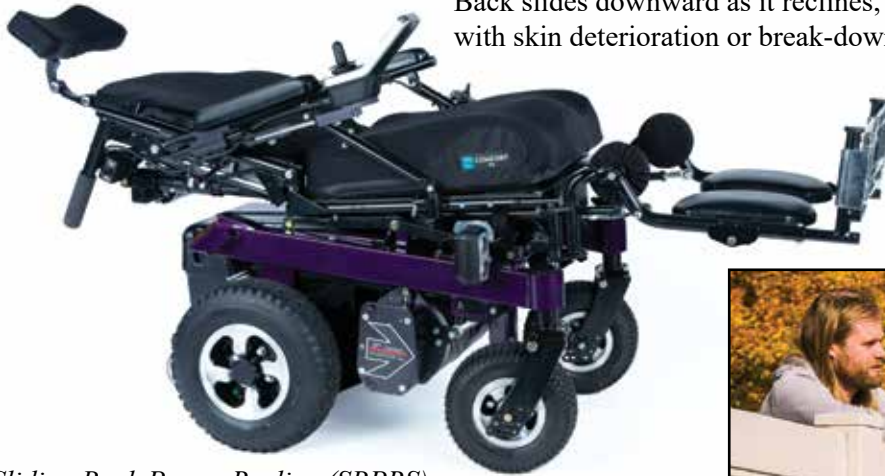
Sliding Back Power Recline (SBPRS)