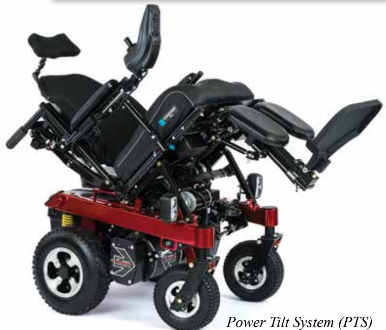
Power Tilt System (PTS)